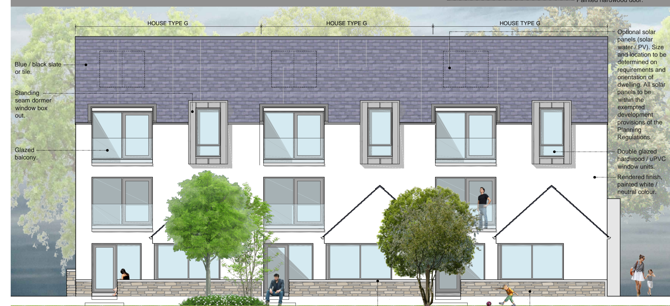
COURTYARD ELEVATION SCALE 1:100