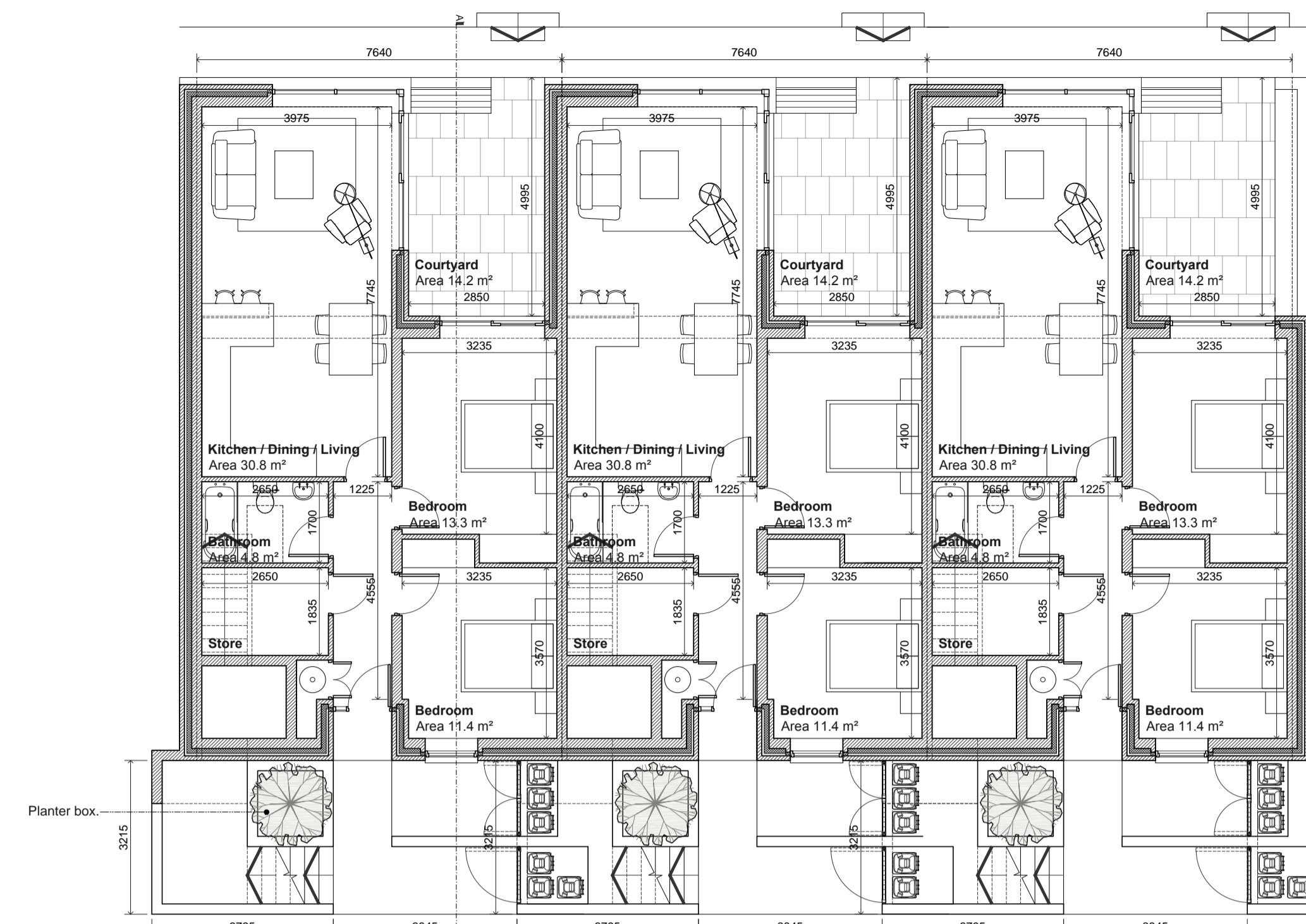
GROUND FLOOR PLAN SCALE 1:100