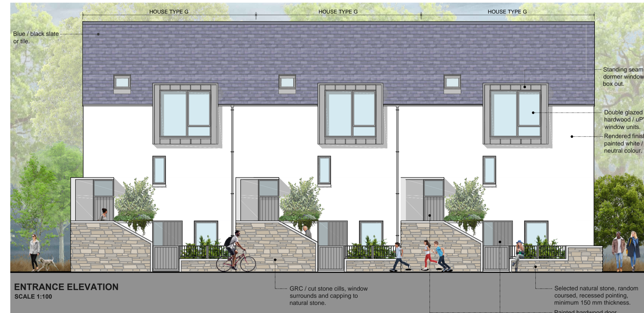
ENTRANCE ELEVATION SCALE 1:100